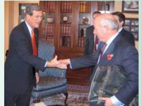
Godfrey Bloom MEP meets former Senate majority leader Trent Lott

A highlight was meeting with Senator Trent Lott, former Republican Majority Leader in the US Senate. Senator Lott was particularly interested in the issues of defence interoperability between UK and US forces and the policy ramifications for both the Atlantic alliance and NATO. Here again our group was pleased to note a great deal of sympathy and support for the UKIP approach to the future of the UK. At each meeting we heard the same story. There was a strong broad agreement about the growing threat that the current policy direction of the EU posed to US