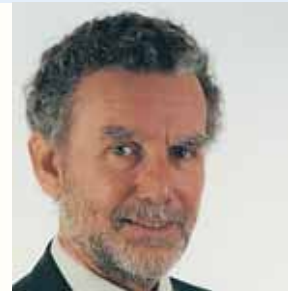
By John Harvey

What do we mean when we say that Britain is perfectly capable of governing herself? What do we mean by Britain? Well for a start, we actually mean the United Kingdom, but that's not really what I had in mind. The UK comprises a small collection of islands off the North West coast of Europe. But independence for 'this precious stone set in a silver sea' - albeit a very interesting stone of igneous metamorphic and sedimentary origin - is hardly enough on its own to set the heart racing.