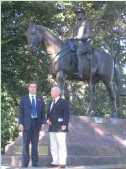
Nigel Farage and Godfrey Bloom at the statue of Sir John Dill

Our meetings covered the major American think tanks, including the Heritage Foundation, Cato, the Brookings Institution and the American Enterprise Institute, the