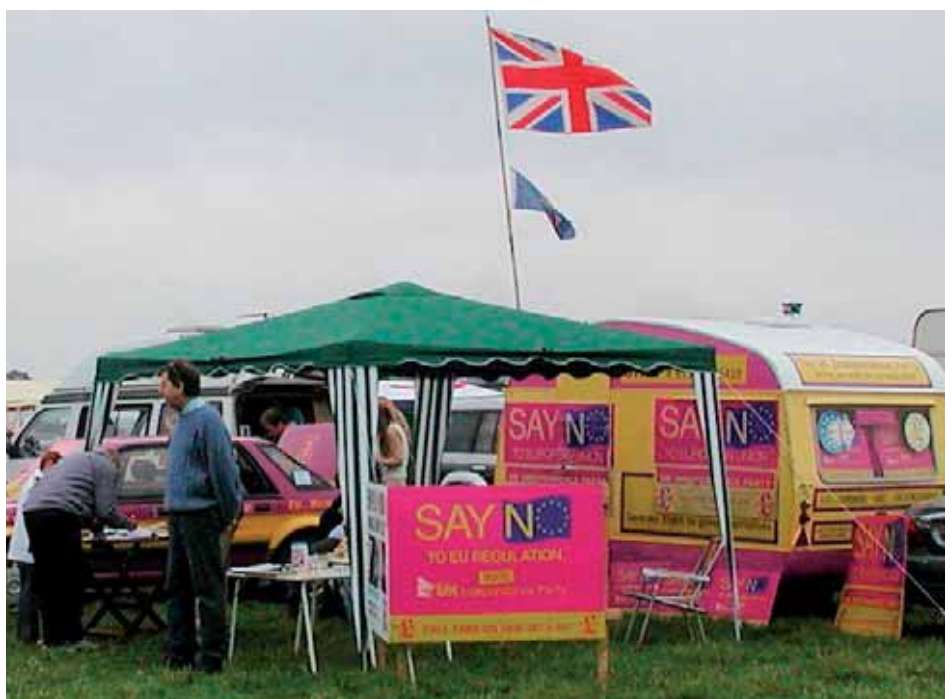
East Point branch at the Henham Steam Rally