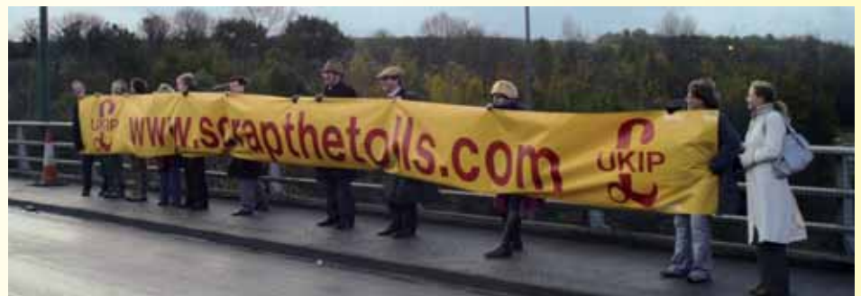
No, the cars are behind you! – the campaign team display the banner for photographers

standing along the bridge at Junction 1A alongside a giant banner advertising the campaign. Total coverage so far? The three newspapers above (due out today), Meridian, Anglia and London Carlton TV, BBC SE TV news, the BBC website, BBC Radio 5 Live, LBC, BBC Radio Kent, BBC Radio Essex, Essex FM, Invicta FM, plus the Press Association. More coverage is expected in the weekly papers which have